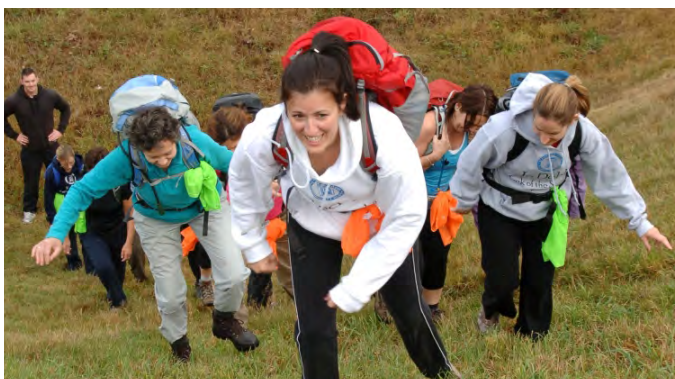
Trekkers being put through their paces at a special PTT Sahara Boot Camp

Everyone is welcome and we look forward to seeing you at our Light Up a Life Carol Concert on the 4th December.