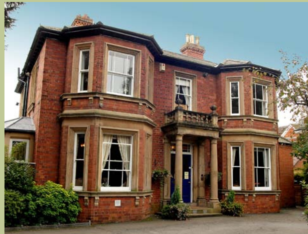
Beaumont House, providing care and support to the community of Newark & District at no cost to the patients or their families

Beaumont House is not part of the NHS but does receive a grant from the local Primary Care Trust (PCT), which contributes approximately one third each year towards the services provided to the community. This means the Hospice needs to raise over £500,000 each year to continue the love and care that first began some 23 years ago.