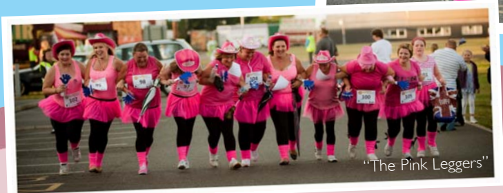
"The Pink Leggers"