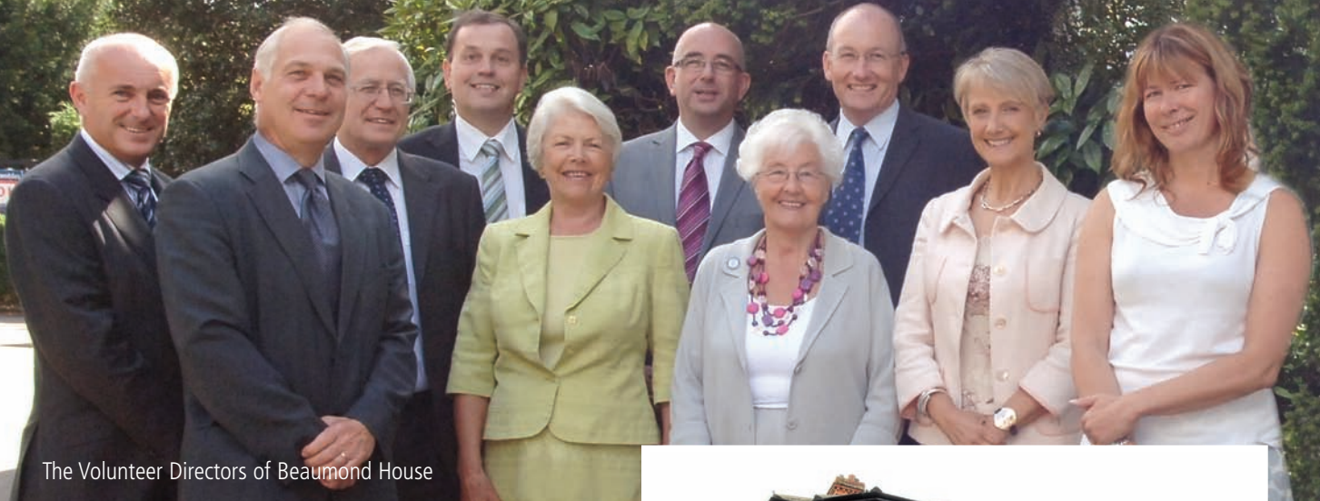
The Volunteer Directors of Beaumont House

There has been a large amount of coverage in the media recently about care and dying concerning people suffering with long term conditions.